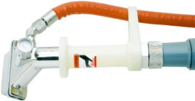
Steam Vacuum Head