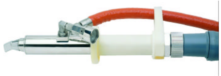
Spinal Cord Remover Head

The Jarvis Steam Vacuum System Model CV-1 - - for the reduction of pathogens and the spinal cord removal on beef, hogs and sheep.