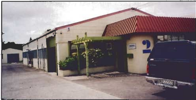
These are pictures of Jarvis' New Zealand plant in Auckland, New Zealand.