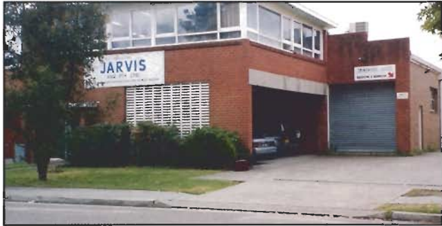
Jarvis ANZ PTY Ltd located in Brookvale, New South Wales, Australia.