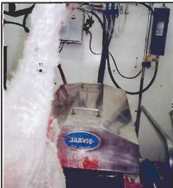
Jarvis New Zealand's latest Sheep Head Cutter operating in the Alliance Group's Sockburn plant in Christchurch, New Zealand.