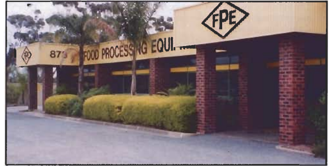
Food Processing Equipment (FPE) located in Adelaide, Australia. FPE is Jarvis' exclusive distributor in the state of South Australia.