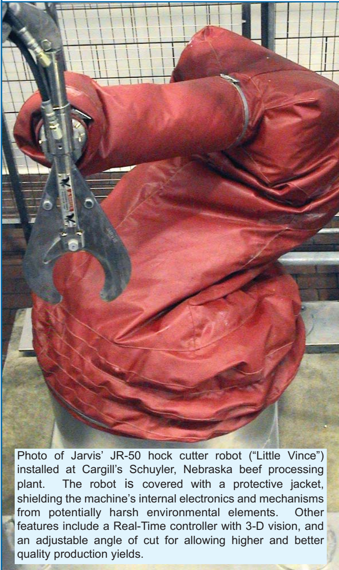
Photo of Jarvis' JR-50 hock cutter robot ("Little Vince") installed at Cargill's Schuyler, Nebraska beef processing plant. The robot is covered with a protective jacket, shielding the machine's internal electronics and mechanisms from potentially harsh environmental elements. Other features include a Real-Time controller with 3-D vision, and an adjustable angle of cut for allowing higher and better quality production yields.