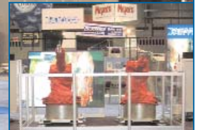
Jarvis' new JR-50 Robotic Head Dropper shown at AMI 2007