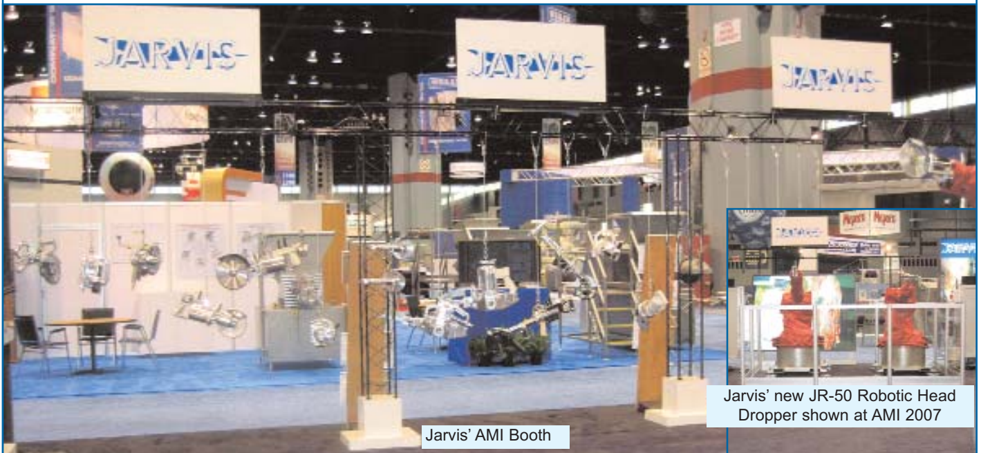
Jarvis' AMI Booth

controller with 3-D vision. Besides the JR-50, Jarvis has additional industrial robots performing other meat processing applications, such as hock cutting, brisket opening, and forequartering. Jarvis Products Corporation is a long-time member of the AMI, a national organization that represents the interest of beef, pork, lamb, veal, and turkey packers and processors.