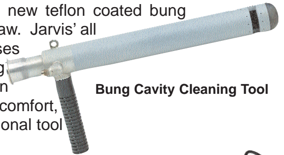
Bung Cavity Cleaning Tool

Jarvis is introducing two new tools - a new teflon coated bung cleaner and an economical horn removal saw. Jarvis' all stainless constructed Bung Cavity Cleaner uses steam to remove contaminants from the bung area. It is lightweight (handpiece weighs less than 4 pounds or 1.8 kg) for easier handling and operator comfort, and the teflon coating makes it easier to clean. An optional tool cleaning sanitizer is also available.