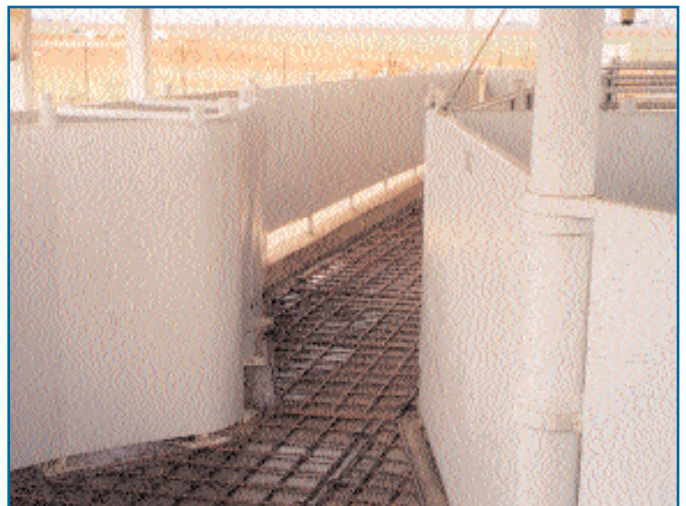
Photos of Tripple A Beef Abattoir's modern feedlot system.