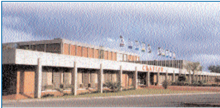
Headquarters building of Crafcor Hygrade and Crafcor Cato Ridge Abattoir. Crafcor is one of the largest meat producers in KwaZulu-Natal province, and is renowned across South Africa for its high-quality product.