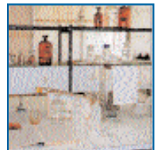
An on-site laboratory continuously monitors hygiene standards at the Cato Ridge plant.