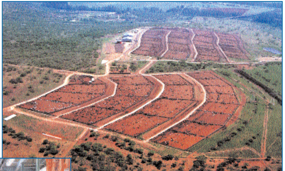
One of Africa's largest feed lots, Crafcor's vast Riversdale feedlot located in Wartburg, South Africa.