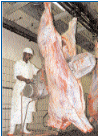
A Jarvis Buster saw cutting through beef carcass at Crafcor's Cato Ridge Abattoir meat processing plant.