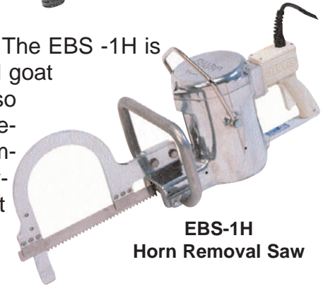
EBS-1H Horn Removal Saw

Also new is Jarvis' Model EBS -1H Electric Horn Removal Saw. The EBS -1H is specifically designed for inexpensive removal of beef, sheep and goat horns. Besides being economical to own and operate, it's also small and maneuverable for better operator handling. A 1.9 horsepower, totally enclosed, 3 phase motor provides optimum performance. For more information about the new teflon coated bung cavity cleaner and EBS -1H Horn Removal Saw, contact Vin Volpe at 860 347-7271; fax: 860 347-9905; e-mail address is: jarvis.products.corp@snet.net .