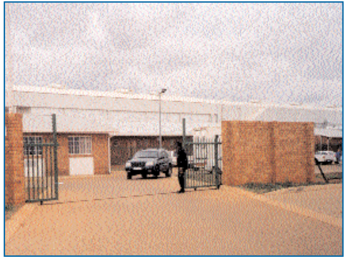
Main gate at Crafcor Abattoir's Cato Ridge processing plant.