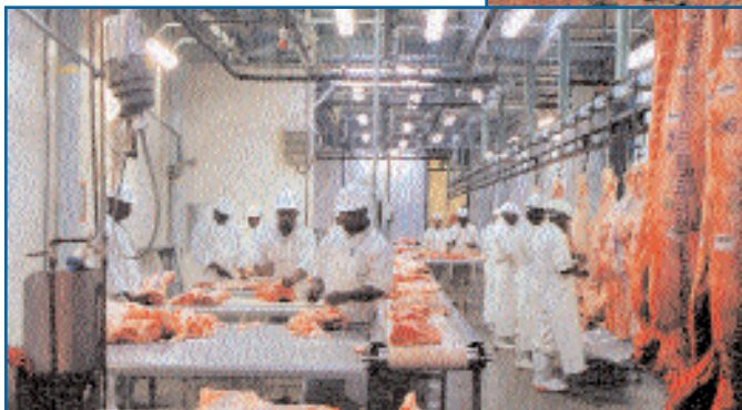
Ultra-modern cutting room at Crafcor's Cato Ridge Abattoir processing facility. Strict hygiene standards are regularly monitored to maintain maximum product shelf-life.