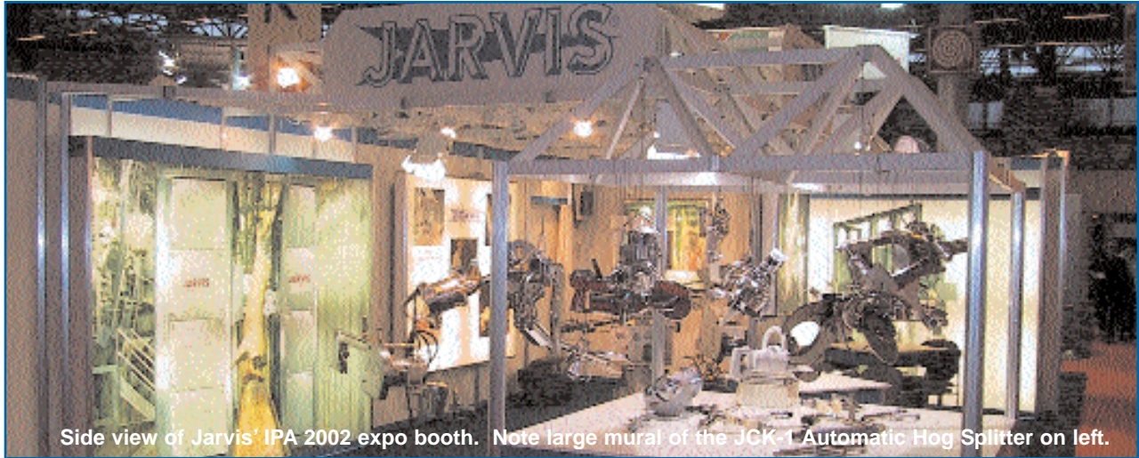
Side view of Jarvis' IPA 2002 expo booth. Note large mural of the JCK-1 Automatic Hog Splitter on left.

France's bi-annual IPA expo is one of the world's major meat processing technology exhibitions. In 2002, the show was held at Paris' Nord Villepinte Exhibition Center, November 18-22. For Jarvis, this expo offered an opportunity to demonstrate our latest products to European, Middle Eastern and African customers. Participating in the show besides Jarvis was Industrade of France, Jarvis' exclusive French distributor, and our sister company, Edge Manufacturing.