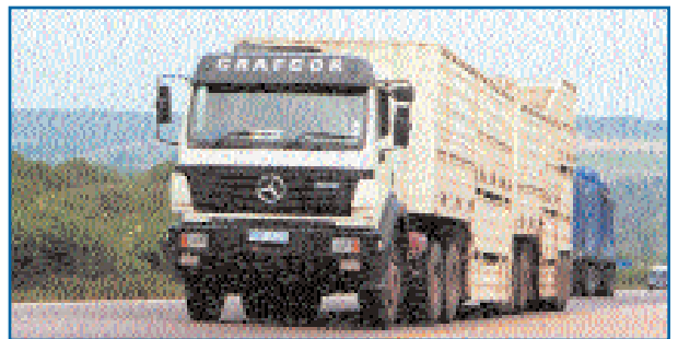
To maintain the highest meat quality, Crafcor uses sensitive, humane methods to reduce stress when transporting animals to their production facility.