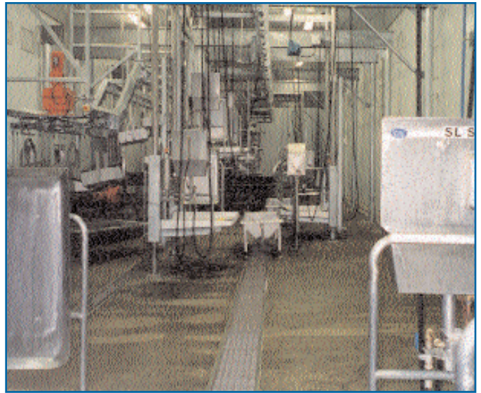
Photo of Tripple A Beef Abattoir's modern Pietermaritzburg processing facility.